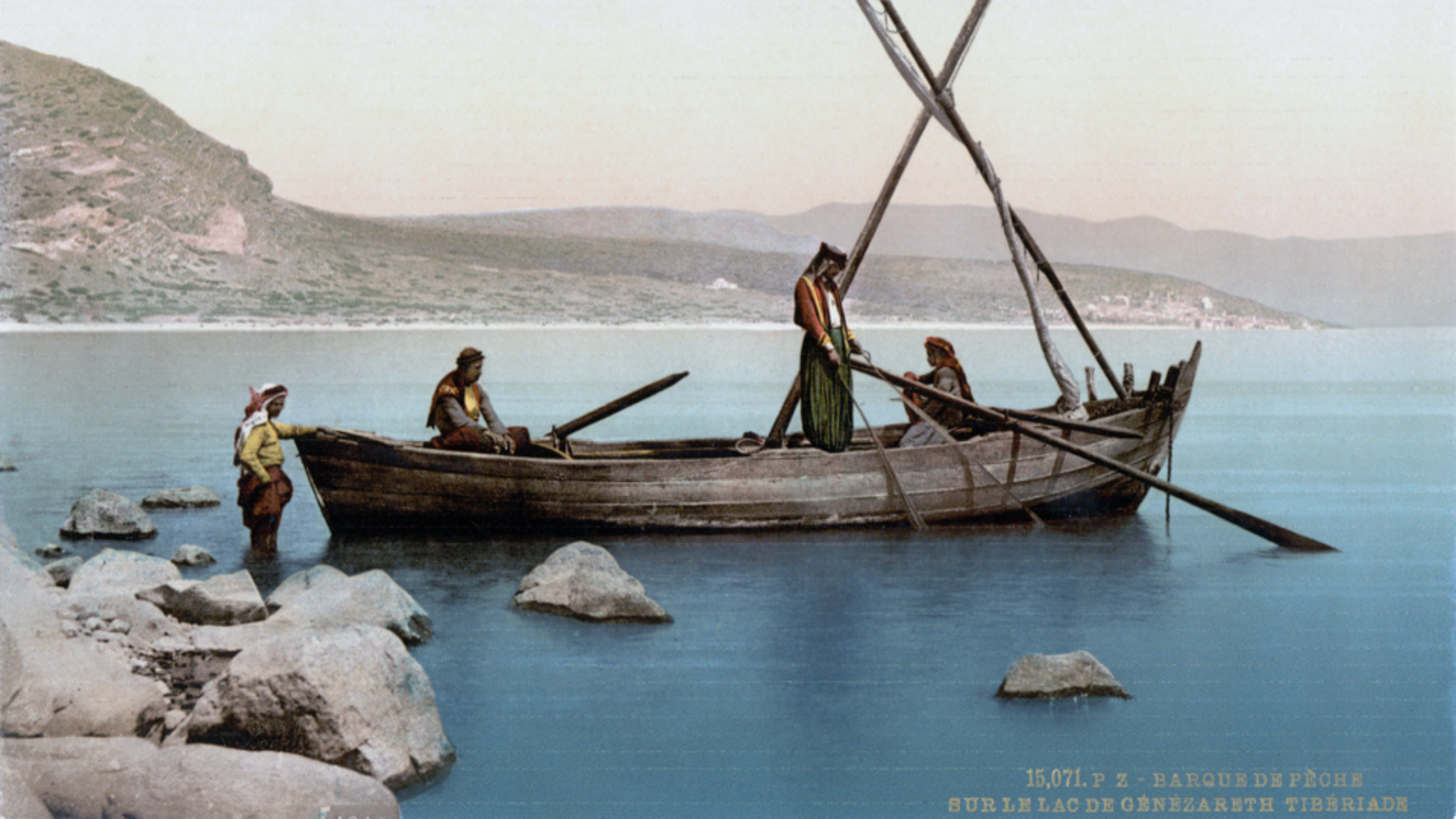
15,071. P Z - BARQUE DE PÊCHE SUR LE LAC DE GÈNÈZARETH TIBÉRIADE