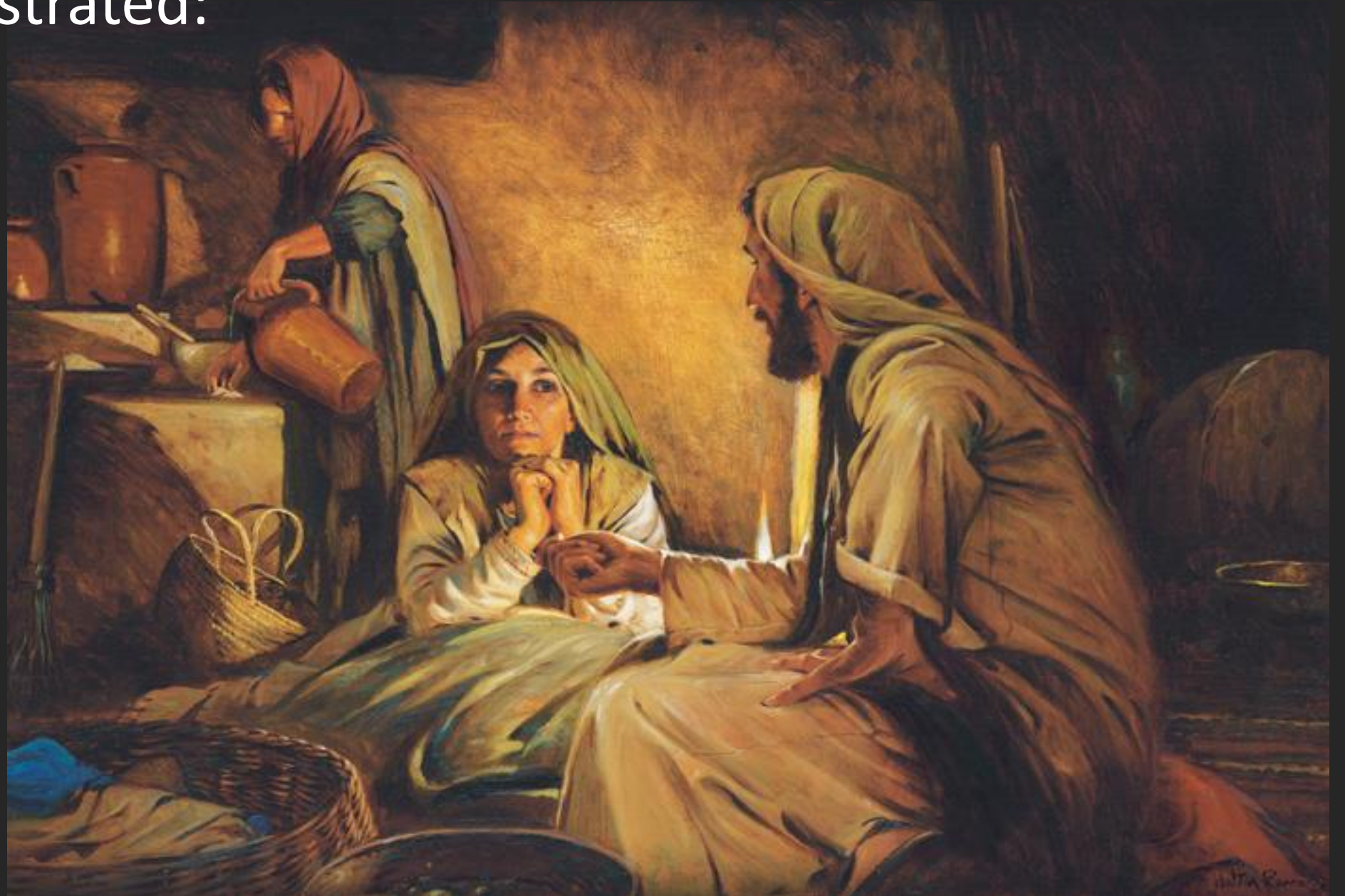
Mary and Martha